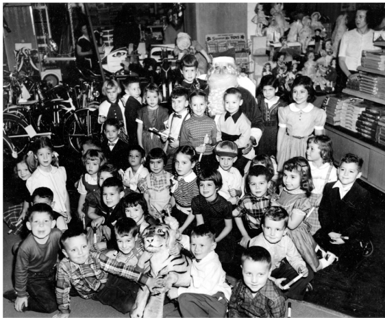
CHRISTMAS FOR KIDS IN GASTON COUNTY